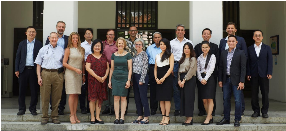
Participants of the 'Secured Transactions Law in Asia' Symposium